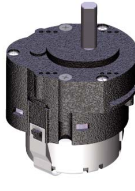
SERIES 262-HT 117/230V AC