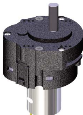
SERIES 262-HT 24V DC