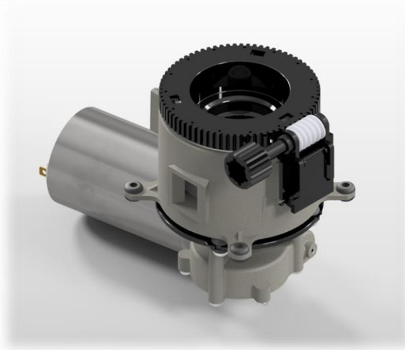
SERIES 257 – 230 V DC SERIES 257 – 120 V DC

Coffee grinders are devices for grinding coffee beans with the possibility of setting the desired particle size (from fine to coarse) according to requirements. Ground coffee can be dispensed with timed dosage through.